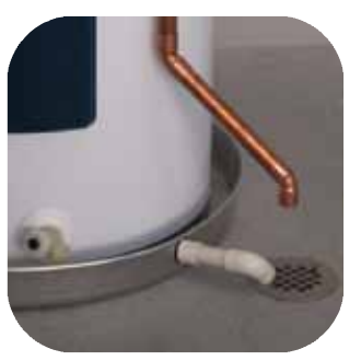
Drips from the Temperature and Pressure (T&P) Relief Valve discharge pipe usually mean you need a thermal expansion tank or your home's water pressure is too high (see Step 3). Warning: Do not plug or cap the T&P discharge pipe.

If you have no hot water (not even warm) after a few hours, check to make sure the water heater is getting power. If you have power but no hot water, the upper element may have been "dry fired" and will need to be replaced. Replacement elements are inexpensive and widely available.