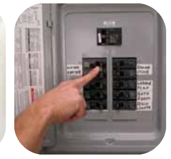
Turn the circuit breaker (or fuses) back on (and the disconnect if you have one). Because the tank is full of cold water, it may take several hours to reach normal operating temperature.