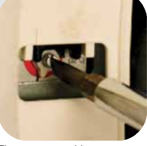
The upper and lower thermostats are both set at the recommended temperature setting of 120° Fahrenheit at the factory. Higher temperatures increase the risk of scalding. See the Installation Instructions and the water heater's labels for detailed instructions and important safety information about scalding.