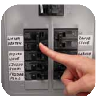
Locate the circuit breaker marked "water heater" and turn it OFF. Some homes use fuses which should be removed. Your water heater may also have a disconnect switch which should also be turned OFF.

If your house has copper pipes, consider an Installation Kit with compression fittings that do not require soldering. If your pipes are plastic, you'll need connectors/fittings for the specific type of plastic pipes used in your home. Read the instructions for the new connectors before cutting the existing water pipes.