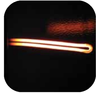
If the tank is not completely full of water when electric power is turned burn out. If this happens, you'll have no hot water until the upper heating element has been replaced.