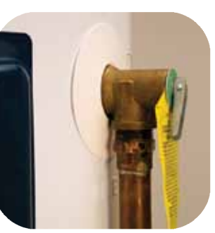
The Temperature and Pressure Relief Valve (T&P) is an important safety device. It opens to relieve pressure if the water temperature or pres- of no more than 6 inches sure is too high. Use the new T&P that came with your new water heater. Don't reuse the old T&P valve.