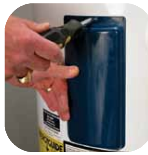
Replace the insulation, plastic protectors, and the upper and lower access panels. Replace the cover on the electrical junction box (on the top of the water heater).