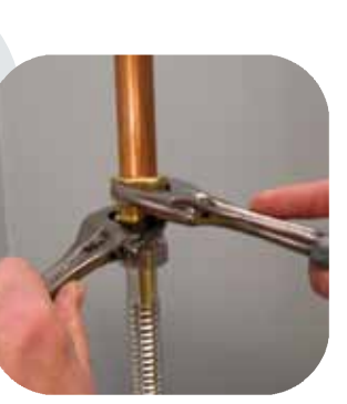
Check the water connections for leaks. Most leaks are due to problems with the inlet or outlet water connections (not a tank leak).