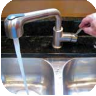
Open a hot water faucet and let the hot water run until it's cool. Then, shut off the cold water supply to the water heater. Leaving the hot water faucet open will help the tank drain.