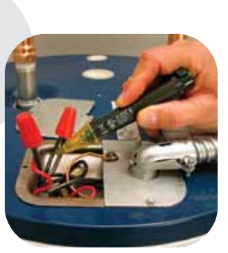
Because circuit breakers can be mismarked, always check the incoming power wires with a voltmeter or circuit tester to make sure the circuit you are working on is OFF.