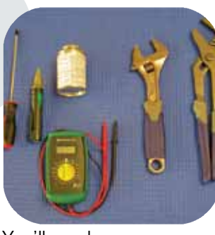
You'll need common plumbing tools and pipe joint compound (or Teflon<sup>®</sup> tape) approved for potable water. You'll also need a circuit tester or voltmeter. Most codes require the water heater to be installed in a metal drain pan. See the Installation Instructions for information about sizing the drain pan and other installation details.