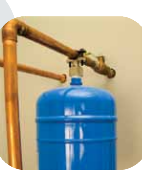
Almost all homes have check valves in the plumbing system and now need a thermal expansion tank installed near the water heater. The expansion tank is attached to the cold water inlet line. To operate properly, the expansion tank must be pressurized with air. Refer to the expansion tank's instructions for details.