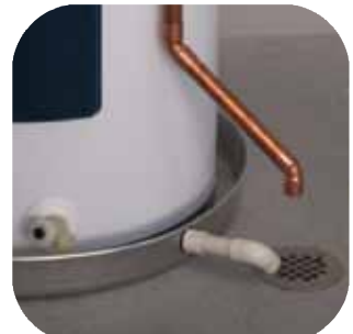
The Temperature and Pressure Relief Valve (T&P) discharge pipe should be terminated near a floor drain with an air gap between the end of the discharge pipe and the drain. Some localities require terminating the T&P discharge pipe outside. In cold climates, we recommend using a floor drain. In all cases, follow the codes for your location. Warning: Do not plug or cap the T&P discharge pipe.