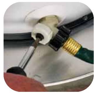
Connect a garden hose to the drain valve. Place the other end of the hose in a drain or outside (you could also use buckets). Open the water heater's drain valve. While the water heater is draining, read the Installation Instructions that came with your water heater. Disconnect the water and power lines and remove the old water heater.